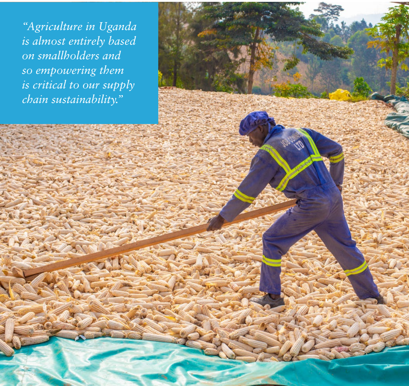
Grainpulse workers remove poor-quality maize before processing.

“Agriculture in Uganda is almost entirely based on smallholders and so empowering them is critical to our supply chain sustainability.”