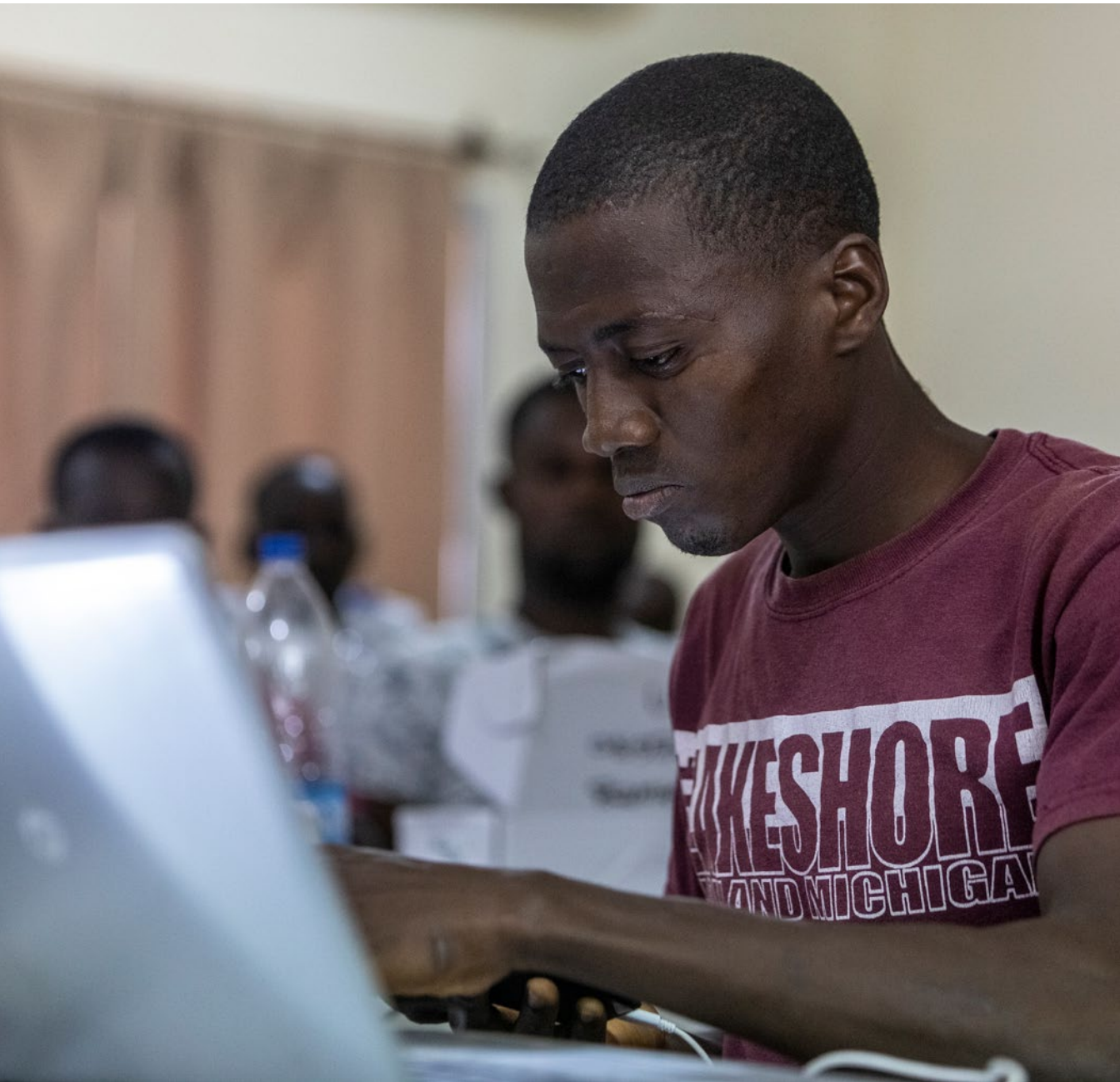
Participants in Cargill's Coop Academy study governance, digitization, traceability, and sustainable development.