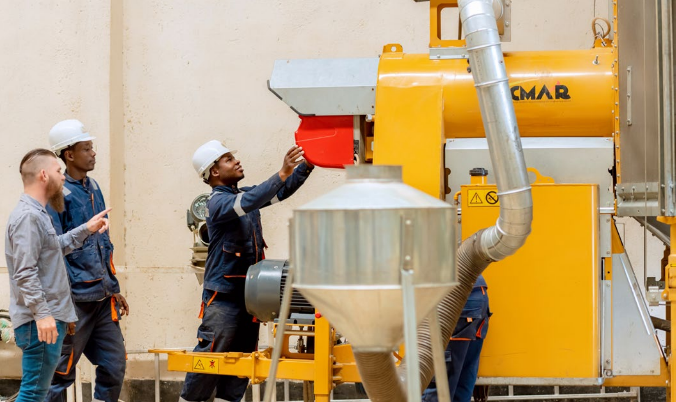
In Kigali, factory workers at AflaSight sort through maize kernels.

My field visit this past summer, after more than two years of COVID-19-related travel restrictions, was humbling and inspiring—and much overdue. I returned to IFC headquarters in Washington D.C. with many stories about farmers eager for training, knowledge and access to finance. These are men and women who are confronted daily with the reality of climate change and want tools to boost their resilience—whether by building an irrigation pump for their crops or a trough system for their cattle. Indeed, I returned to my office newly energized to continue working closely with our investment and advisory teams to create innovative solutions that support the world’s rural poor. IFC and GAFSP are leading the way in mobilizing private capital for development using unique blended finance solutions.