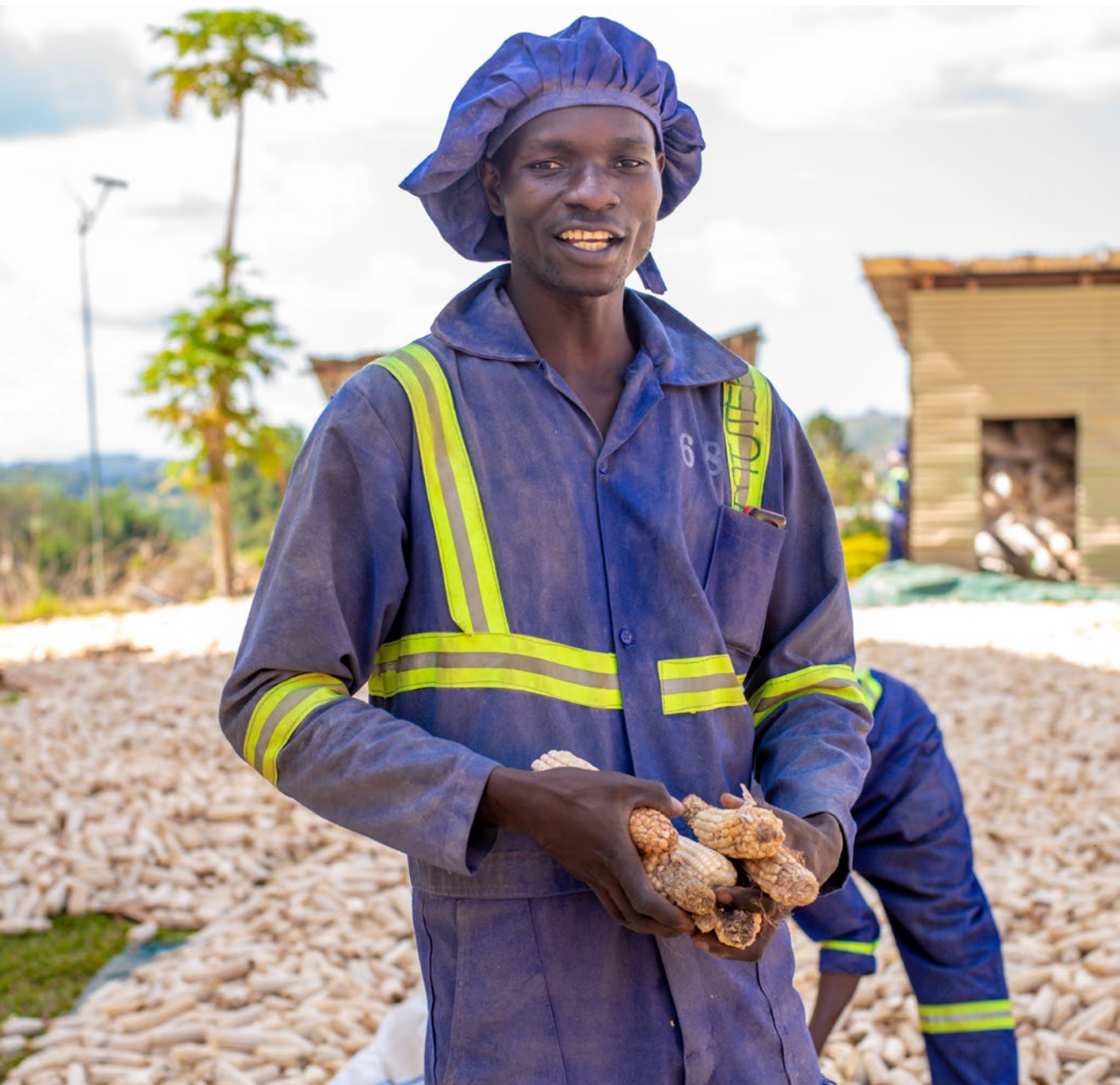
At the Grainpulse factory outside Kampala, workers sort maize.